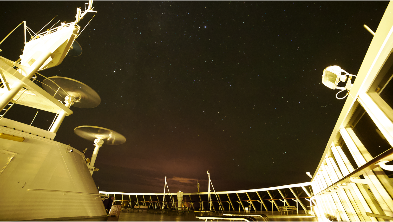
The night sky above the North Sea on board Borealis.