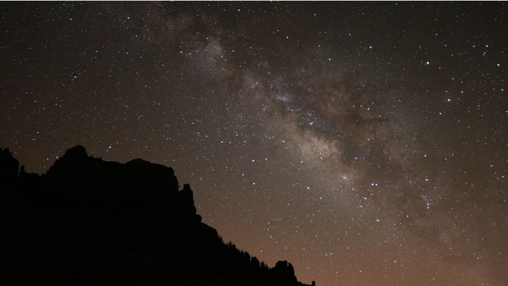
The Milky Way.