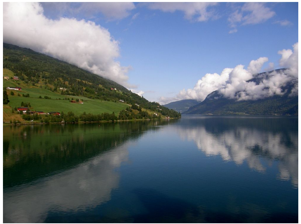
Balmoral'sfive-night L2628 'Norwegian Fjords in Five Nights' cruise, departing from Newcastle on 28<sup>th</sup> August 2026. Prices start from £599 per person.