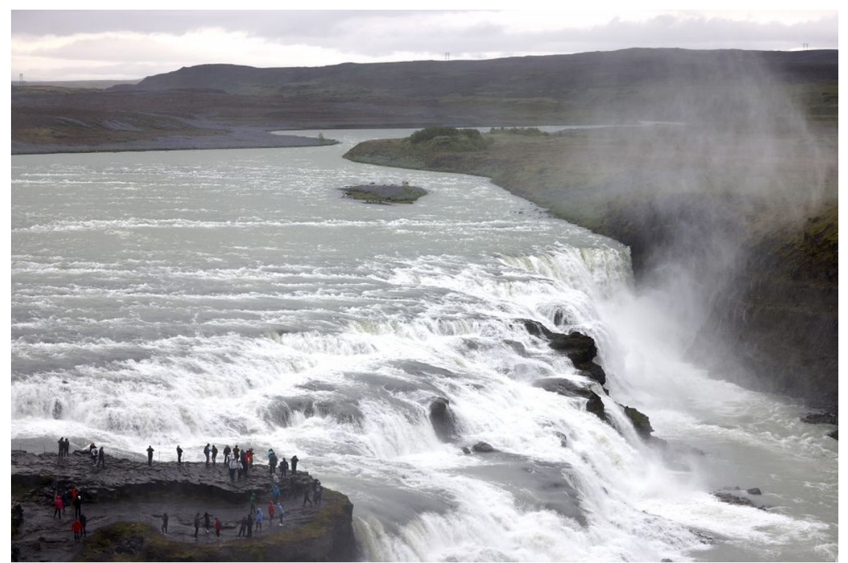
Balmoral's12-night L2625 'Wonders of Iceland with the Solar Eclipse' cruise, departing from Rosyth on 6<sup>th</sup> August 2026. Prices start from £1,599 per person.