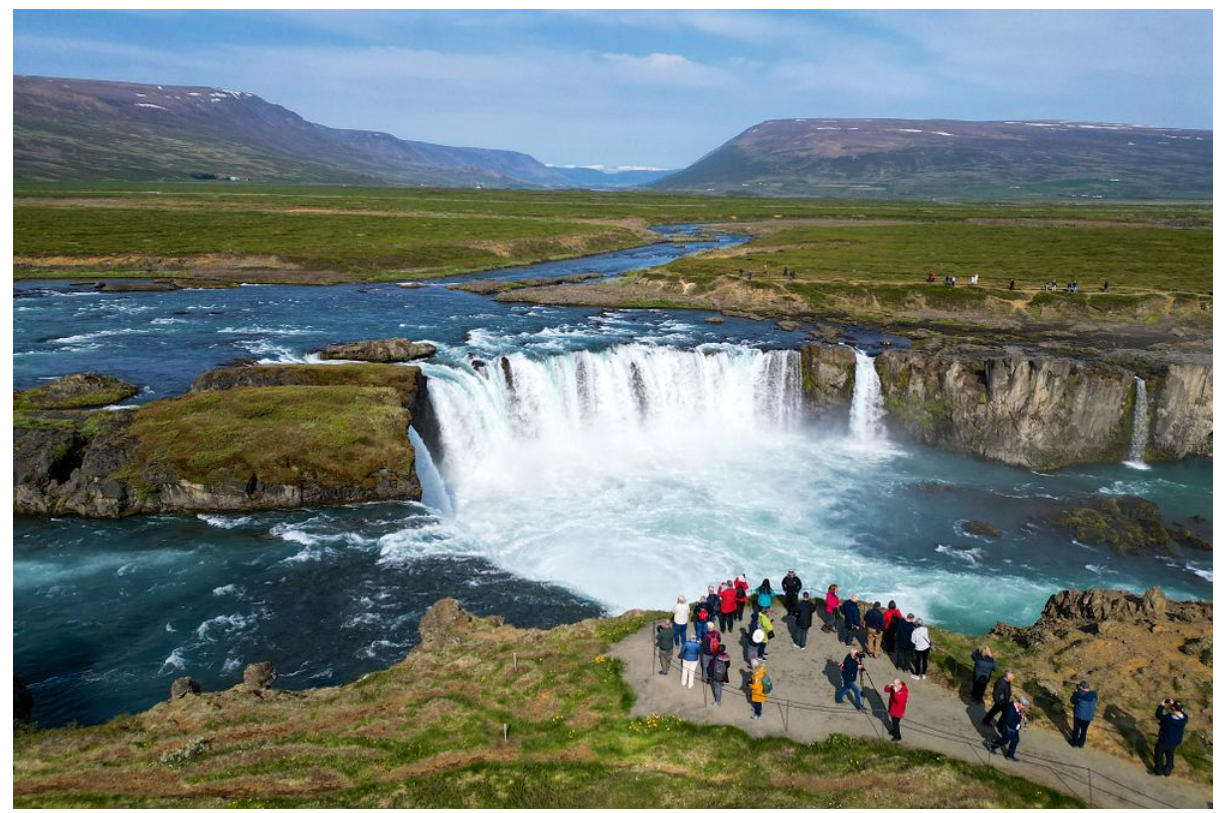
Bolette's11-night T2619 'Wonders of Iceland with the Solar Eclipse' cruise, departing from Liverpool on 7<sup>th</sup> August 2026. Prices start from £1,499 per person.