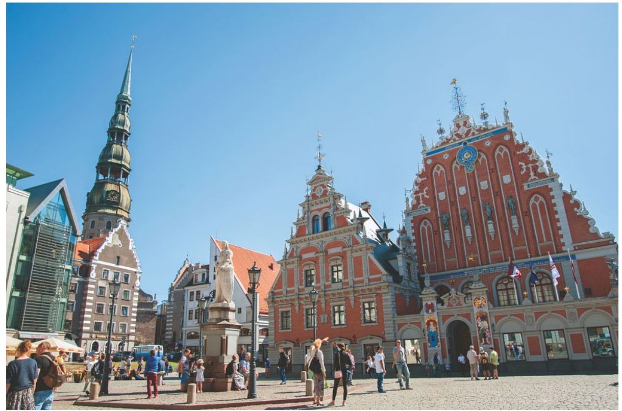
Borealis '14-night S2613 'Enchanting Landmarks of the Baltic' cruise, departing from Southampton on 4<sup>th</sup> June 2026. Prices start from £1,599 per person.