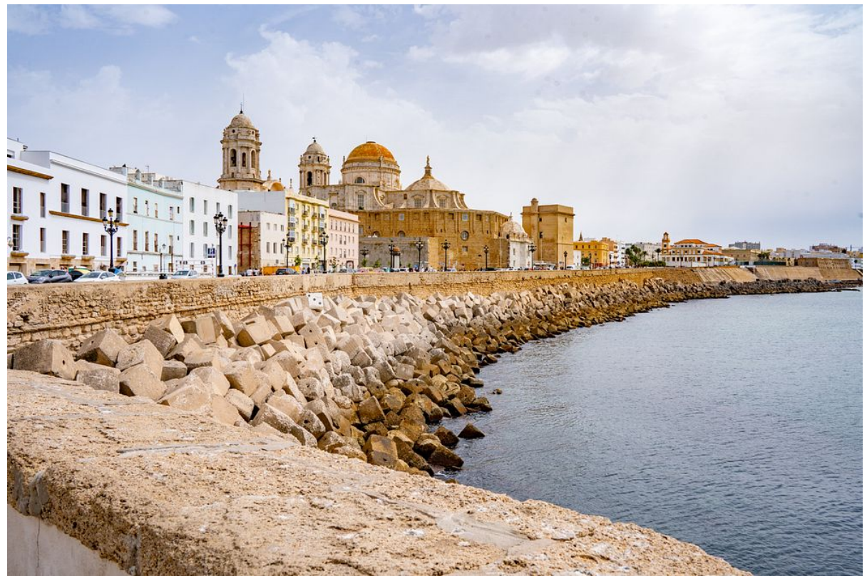
Borealis 10-night S2620 'Northern Spain with the Solar Eclipse' cruise, departing from Southampton on 10 <sup>th</sup> August 2026. Prices start from £1,299 per person.